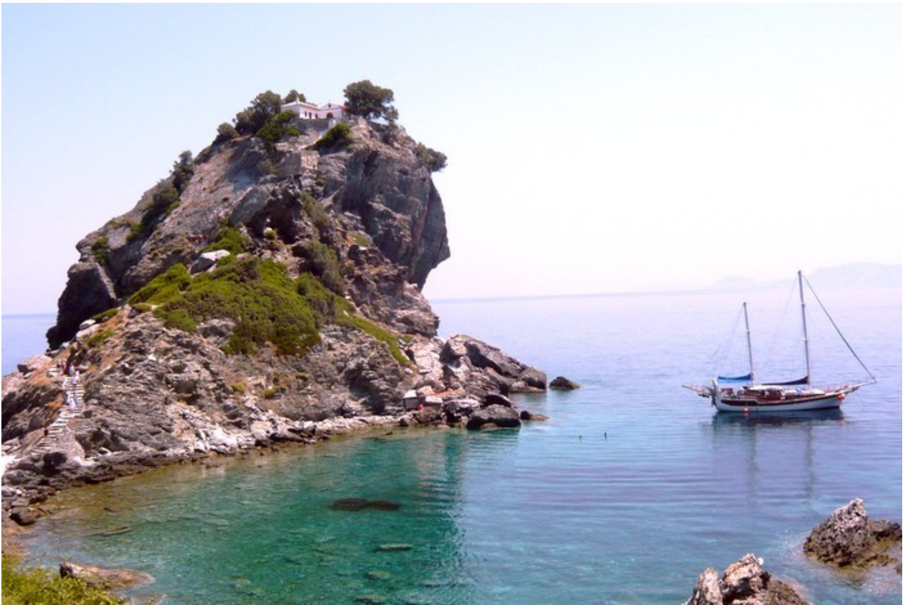
ANATOLIE on anchor under "Mamma mia" Church