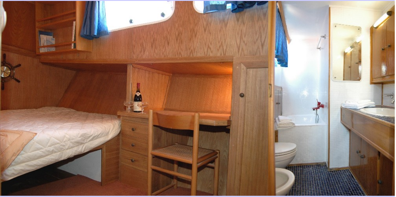
The two master cabins with their private bathrooms...